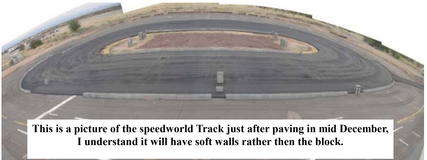
This is a picture of the speedworld Track just after paving in mid December, I understand it will have soft walls rather than the block.